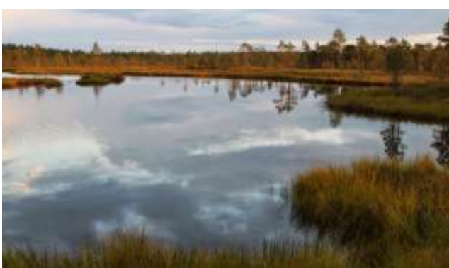
TRAIL DESCRIPTION (from Nummikangas)

Kauhalammin kierros is part of the Kauhaneva-Pohjankangas National Park, which is one of the most wilderness-like destinations in Southwest Finland with its bogs and barren heath forests. The rich and impressive bog nature displayed by Kauhalammin kierros allows you to relax and get away from the everyday grind.